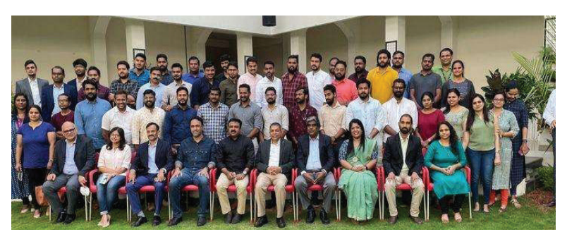
XIME Kochi team