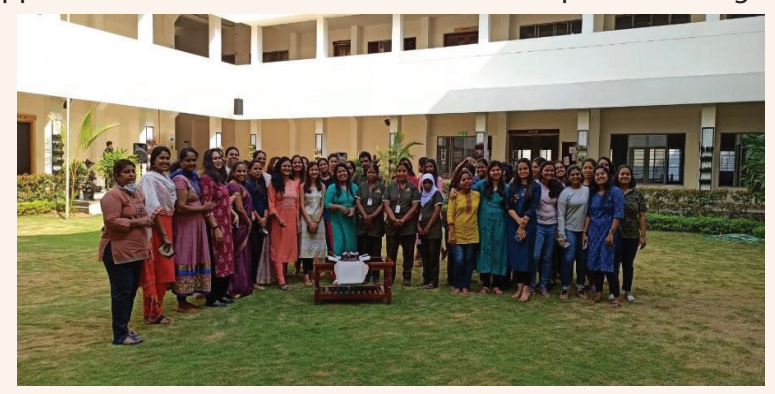
Women staff of XIME Kochi with the students

Games and other cultural events were also organised on the next day, making it a fun-filled evening. Musical chair competition, 'letter for her' were some of the events organized. Tothank and honour the non-teaching women staff, gifts were distributed to each of them. Female faculty were summoned to the stage and asked to perform some funny tasks, which further added fun to the festive atmosphere. In addition, the men on campus organized a game night for the women. Every event winner received a gift as a token of appreciation. The celebrations were wound up with a DJ night.