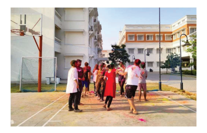
XIME Chennai HOLI Celebration

Batch 4 & 5 of XIME Chennai celebrated Holi in the campus. The celebration was filled with colors, unity and friendship. Everyone enjoyed the festival with a glint in their eyes, spring on their feet and colors all over.